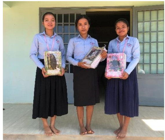
Student Teachers received prizes

In December the JGG Chairman conducted this contest for the 50 Student Teachers. Three Student Teachers achieved perfect scores and received their prizes.