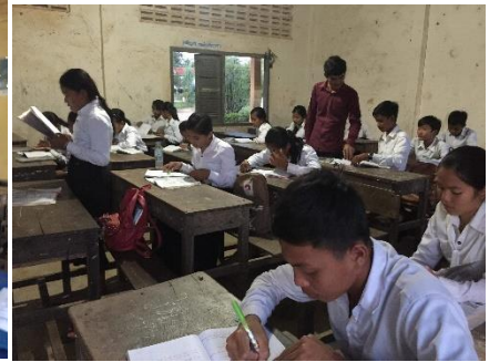
Class inspection by JGG staff