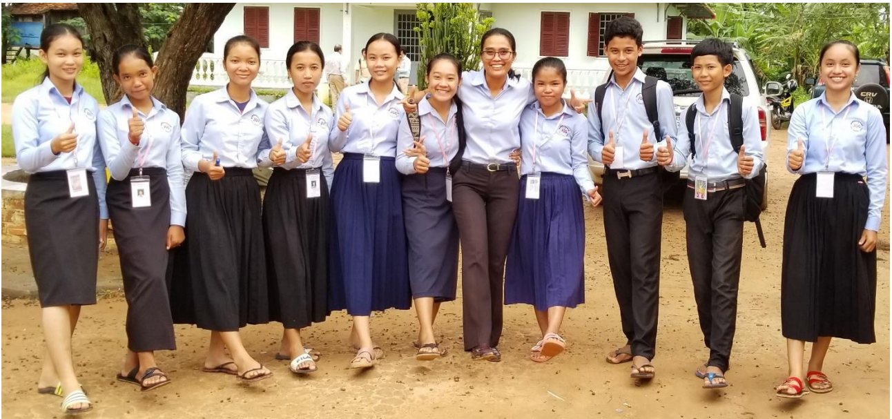
JGG Chairman with some of the Romlech high school Student Teachers

JGG's English Program in Bakchinhchien and Romlech Hun Sen High School are Supported by JGG, Wings of Hope, Nathan Yip Foundation and Friends of JGG.