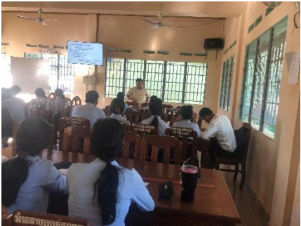
Student Teachers' Weekly Meeting