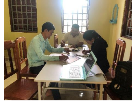
Monthly Staff Meeting