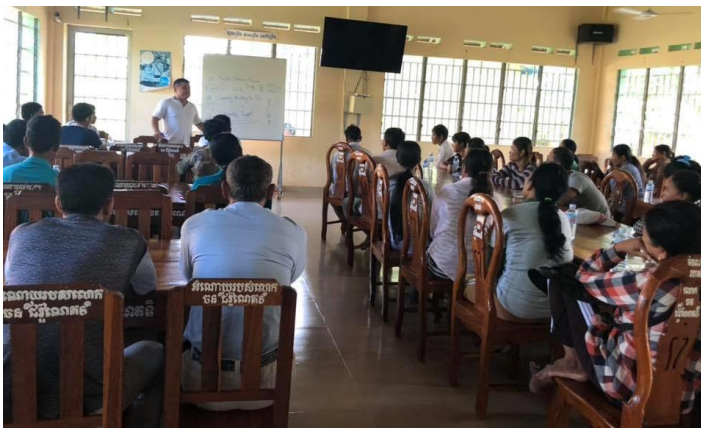
Student Teachers' Parent Meeting

In October 2018, JGG conducted a quarterly meeting with the parents of Student Teachers at JGG Learning Center's in Bakchinhchien and Romlech. The meetings updated them on JGG's current and future activities. It also provided information related to how their children were performing as Student Teachers. Finally, it stressed to the parents the importance of learning English and requested that they encourage their children to work hard as Student Teachers to achieve this goal.