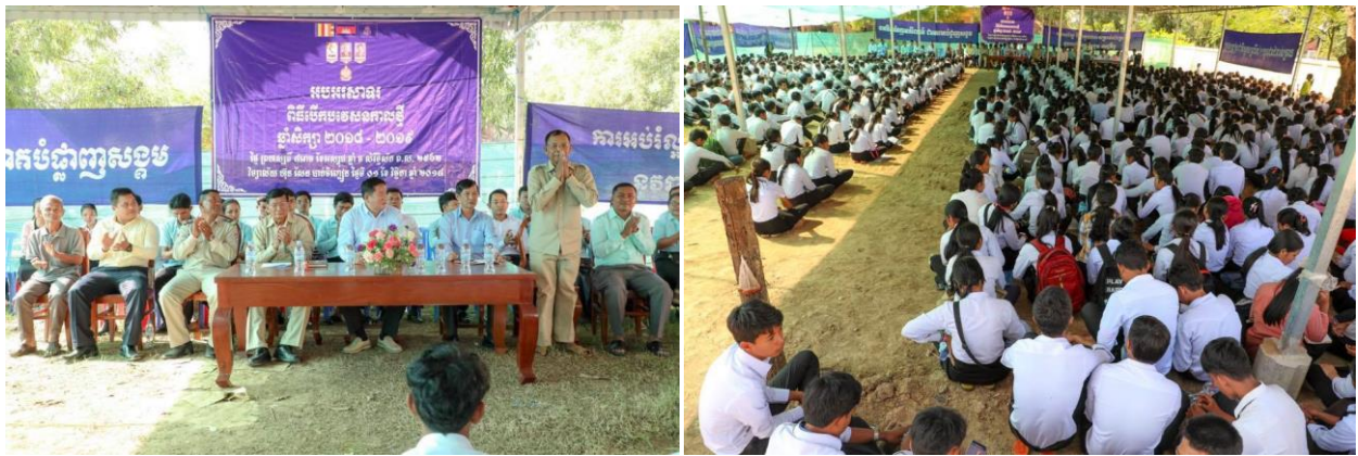
Opening Day 2018-2019 celebrated at Bakchinhchien Hun Sen High School

Opening Day of the School Year 2018 - 2019 was celebrated 1 st November 2018. All students were welcomed back to school. The new 6-year old kindergarten students were excited to join the ceremony for the first time. JGG representatives participated in the celebrations at Bakchinhchien and Romlech Hun Sen High Schools in Pursat where JGG runs its English Outreach programs.