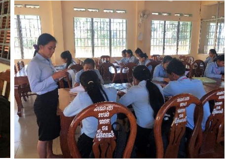
Student Teacher (ST) Teaching ST