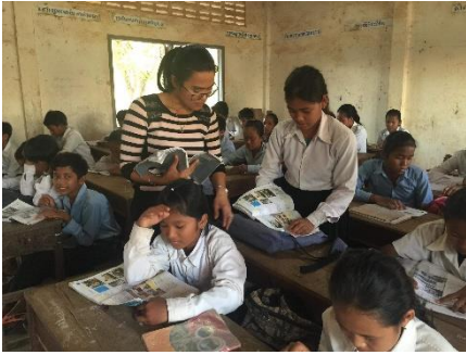
Class inspection by JGG Chairman