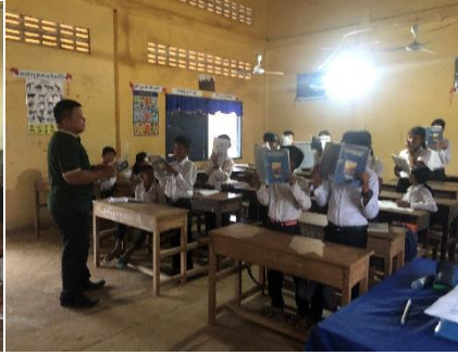
Class inspection by Director