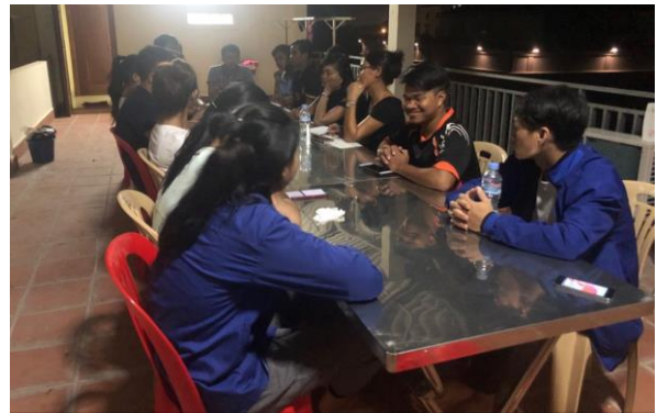
Chairman's Meeting with Former Student Teachers at Phnom Penh Dormitory

The Founder and Chairman also visited JGG's dormitories in Phnom Penh and Siem Reap. One of the highlights of these visits was to meet with the former JGG Student Teachers who have just begun their university studies. In Phnom Penh five former Student Teachers who recently graduated university were invited to share with the new university students their experiences and views about university life and choosing a study major. They also discussed job-related skills such as interviewing, job selection, and how to be a successful employee.