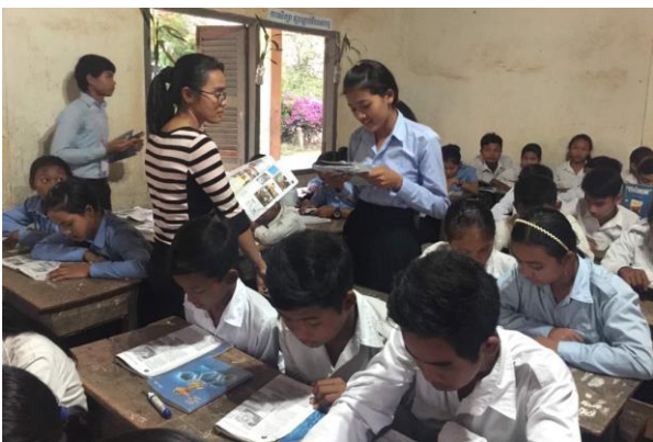
Chairman's Monitoring at JGG in Romlech School