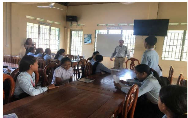
Founder speaking to Student Teachers