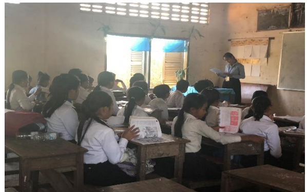
Regular English Outreach Program at Romlech Hun Sen High School held from 5-6PM

JGG's student population was 547 students during the reporting period. This represented a decline of 87 students from the previous quarter due to a combination of performance and attendance issues. Also, the travel distance causes some students to leave the program. Following studying English with JGG from 5 PM to 6 PM after school, many of these students have a 1 to 2 hour bicycle ride to their homes in the dark. It is amazing how so many students and their families value the education offered by JGG that they willingly make this difficult journey every weekday.